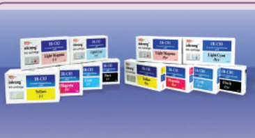
HP 680ml Designjet 5000/5500