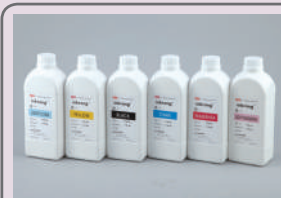
HP 1 Liter For Designjet