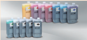
Canon 700ml IPF 8000/9000/8000s/9000s/8100/9100 8300/8300S/8400/9400/9400S