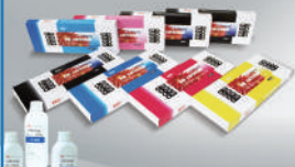
Epson 220ml 9880/7880/4880