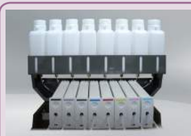
HP 775ml Designjet Z6100