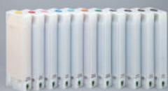
Epson 700ml 9900/7900/9890 7890/9700/7700