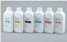
Canon 1 Liter For IPF Series